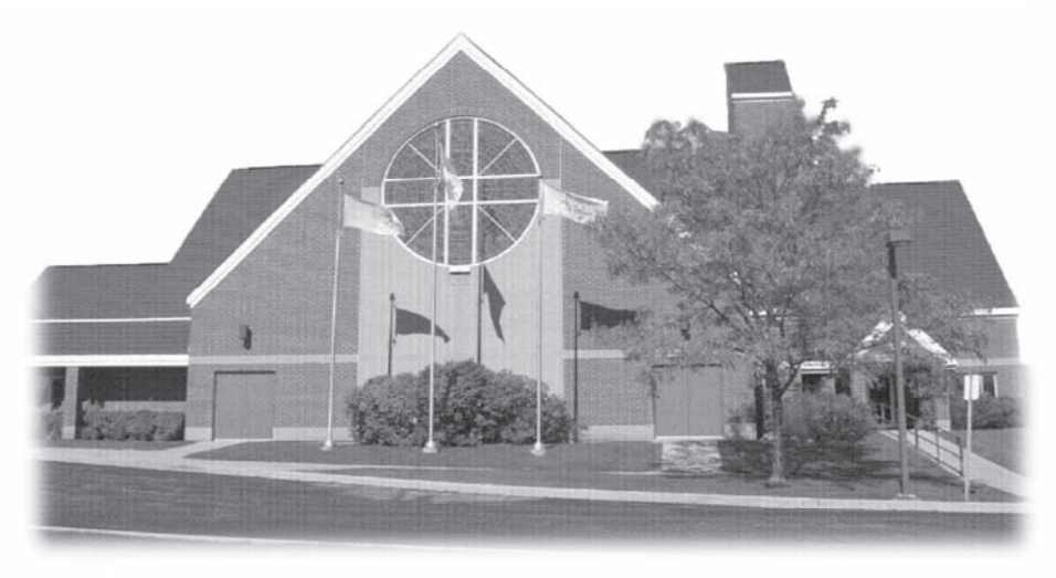
"... The seed is sprouting and growing ..." (Mark 4:27)

ST. VINCENT DE PAUL: White Box Collection on the last Sunday of the month. Call 519-571-8485 for information on food distribution.